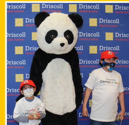
Panda Cares Center of Hope at Driscoll Children's Hospital giving hope where hope is needed, one child at a time.